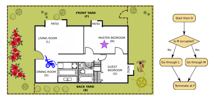
Fig. 1: An autonomous wheelchair navigates in a home. A plan, on the right, generates actions that depend on perception of the pink star (denoting that the bedroom is occupied).

This paper examines in detail how divulging the plan, as above, provides information that permits one to draw inferences. In particular, we are interested in how this plan information might cause privacy violations. As we will see, the divulged plan need not be the same as the plan being executed, but they must agree in a certain way. In our future work, we hope to answer the question of how to find pairs of plans (one be to executed and one to divulged), where there is some gap between the two, so that information stipulations are always satisfied.